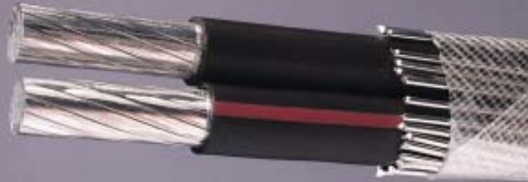
Type SE Style U (SEU)

Cables will bear the following surface marking: Alcan (Plant Of Manufacture) STABILOY® AA-8030 AL Type SE Cable Style U XHHW-2 600 V 2 CDRS (Size) 1 CDR (Size) SUN-RES (UL) (Year Of Manufacture).